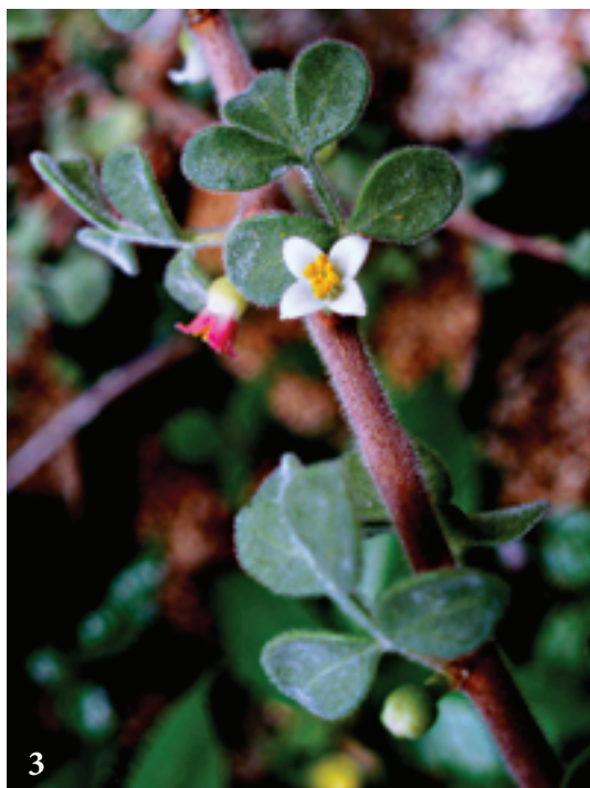
3 A flowering branch showing a pair of male flowers and the pubescence of leaves and stem. The cream-colored flower is a newly opened and the red one is a day old, with pollen ready for release.

flower, however, turns red within 4-8 hours and during this time it begins to deposit a sticky substance on the stigma. This ensures that the pollen carried by ants or other insects, will remain