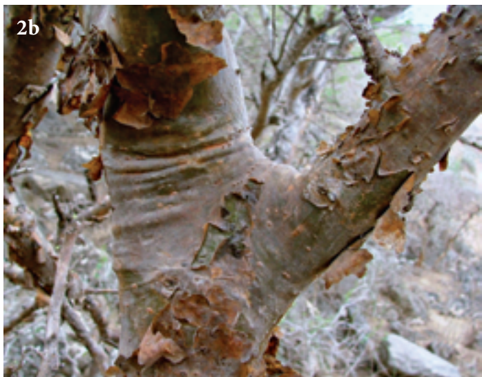
2 a & b A small tree form of Commiphora gileadensis growing in a rock crevice in Oman; photograph by Boris Vrskovy. b Close up of exfoliating bark of tree depicted in figure 2a; photograph by Boris Vrskovy

monsoon period: it leafs out, flowers, gets pollinated, sets seeds and disburses those ripened seeds all within the few months of the monsoon season. As the monsoon rolls out, the trees lose their leaves, remaining leafless for most of the year until the next monsoon season. Occasionally when there is a rise of heat, humidity and low barometric pressure, the plants will leaf out off season but it is unknown if they produce flowers.