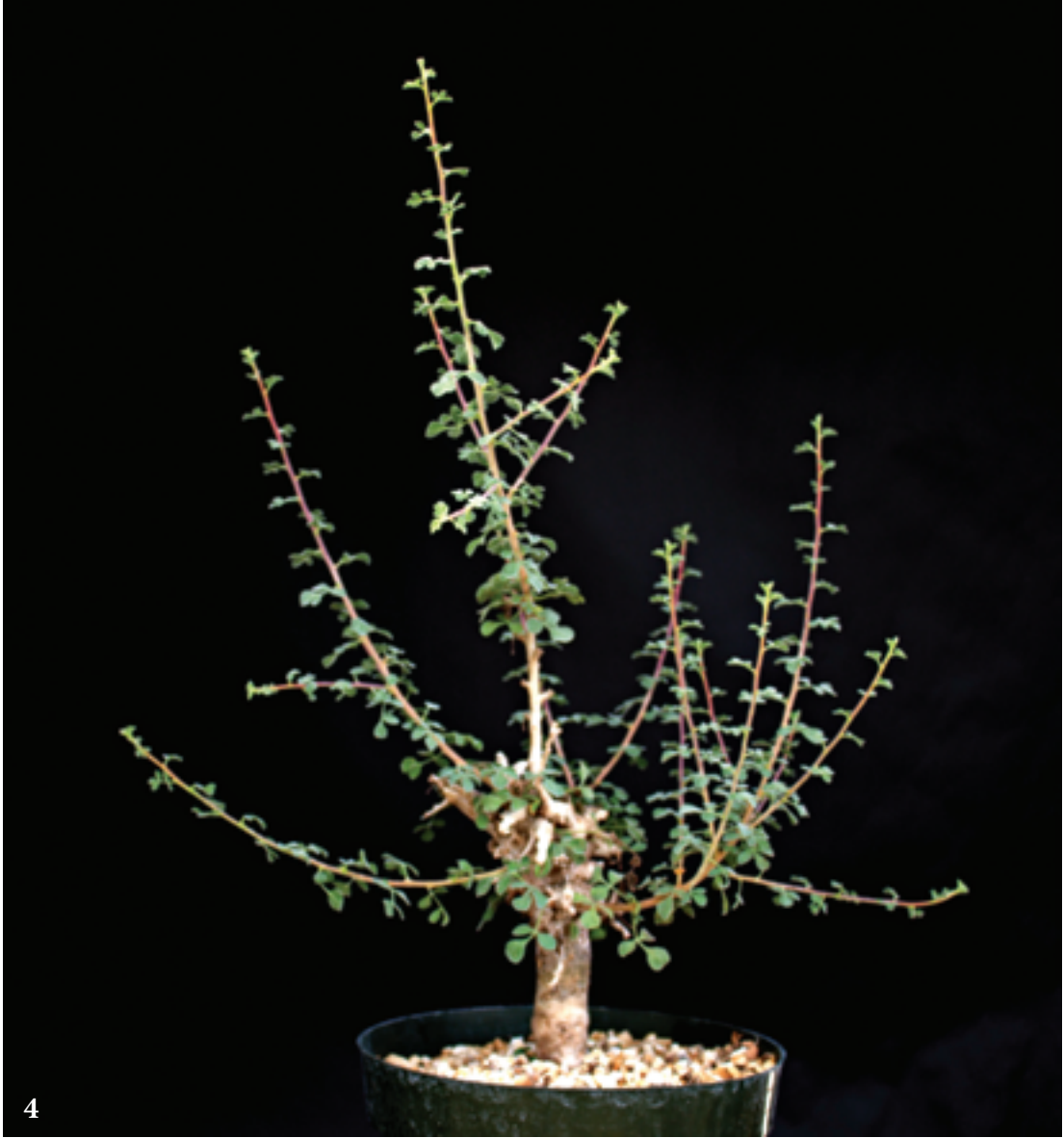
4 A cultivated specimen, in an 8" container, collected in Yemen by Gary James.

on the stigma. It appears that the female plant in its evolutionary process, has developed multiple methods, including catching any air-borne pollen, for a successful pollination.